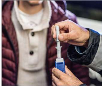
2. Insert the sampler into the funnel opening