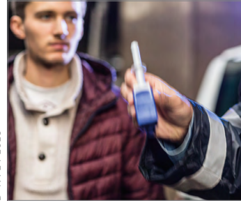
3. Shake the test kit