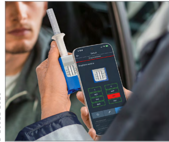
6. Get more efficient with our modular software solution: "Dräger add"