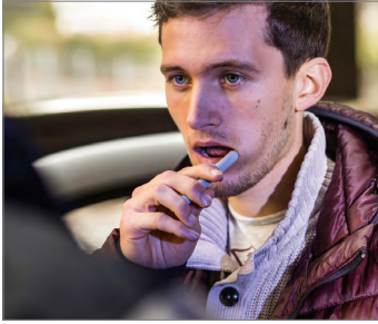
1. Take a saliva sample using the sampler