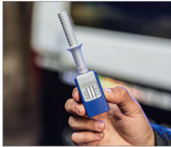
5. Read off the test results