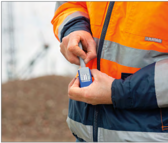
4. Start the test analysis